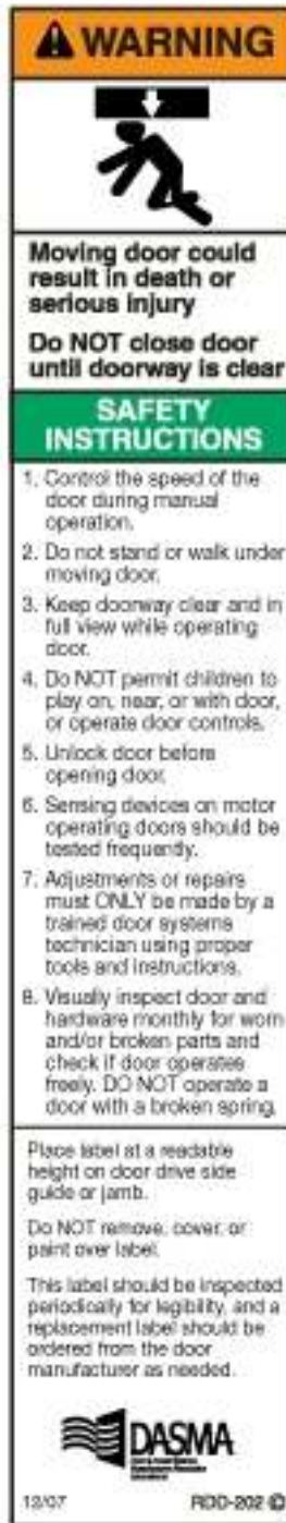
RDD-202 - Size: 1 1/2" x 7 1/2"