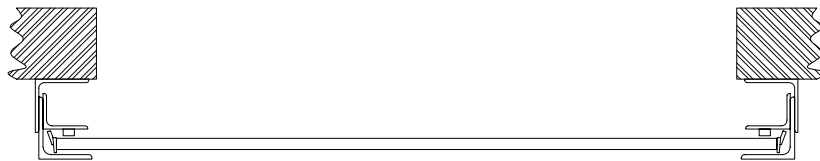
Figure 3 No Wind Load With Windlocks