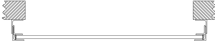
Figure 1 No Wind Load No Windlocks