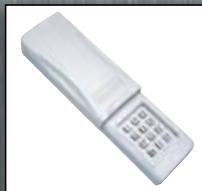
Wireless Keypad with Sliding Cover