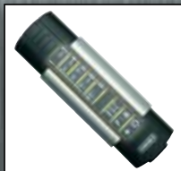
Telecode Wireless Keypad