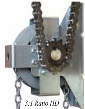
3:1 Ratio HD