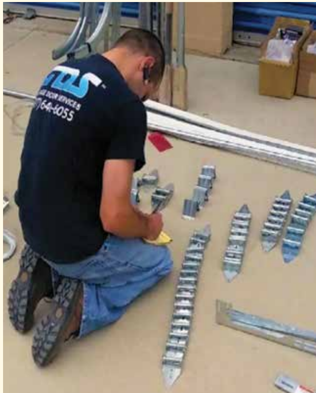
ON THE JOB: A GDS technician takes inventory.

On Jan. 16, 2015, the California Contractors State License Board (CSLB) suspended the license (# 927739) of Garage Door Services. Additionally, on June 29, the CSLB filed a disciplinary action pending against them for advertising without a valid license. A