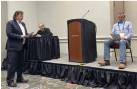
The Mock Trial featured an "all-star cast" of industry professionals. Following the session, the "jury" of nearly 40 attendees engaged in a lively discussion about liability and accountability.

Fencetech also featured nearly 40 educational sessions on a wide variety of topics ranging from troubleshooting and installation techniques to finance and business strategies. Plus, untraditional training formats like DASMA's Mock Trial and Kahoot! Gate Systems Installer Quiz Show added unique sessions for attendees.