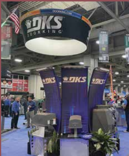
Attendees caught a sneak peek of several new products, including two barrier gate operators from LiftMaster and All-O-Matic.