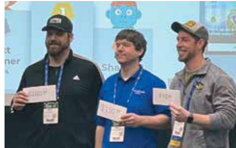
During the "Kahoot!" quiz show, contestants competed by answering questions from the IDEA certification program. The three individuals with the most correct answers in the quickest time received cash prizes ranging from $50 to $150.