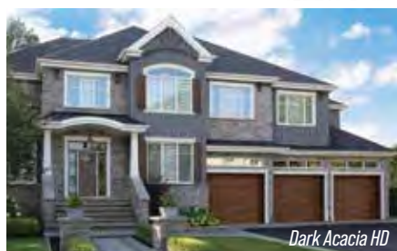
Dark Acacia HD