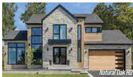
Natural Oak HD

available in Vantage polystyrene-insulated (R-8.7) and Standard+ polyurethane-insulated (R-16) doors. The Plank design features wide plank boards displaying subtle tonal variation and adding warmth and dimension that align with today's exterior styles. Carbon Oak HD has a deep charcoal oak profile that blends mineral gray and graphite shades and offers wood-like richness in