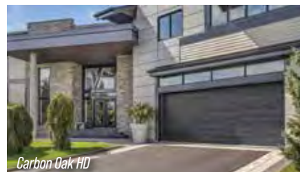
Carbon Oak HD