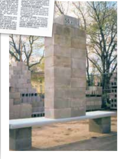
Testing the 3" door, 1989.