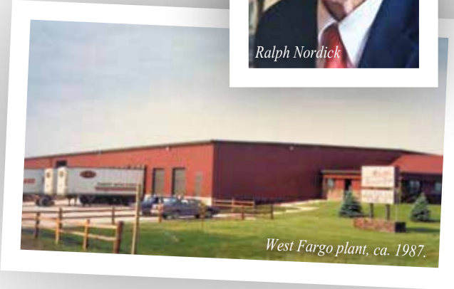
West Fargo plant, ca. 1987.