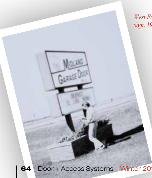
West Fargo sign, 1990.