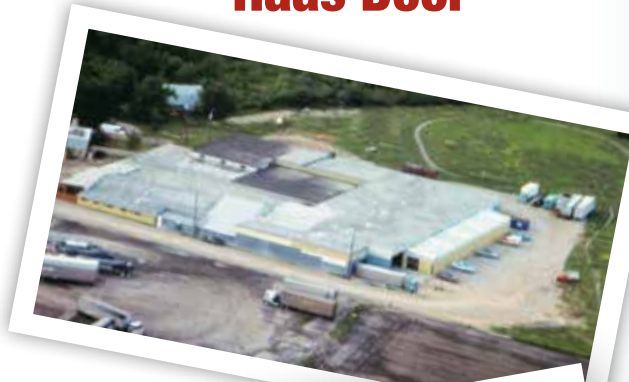
Perrysburg plant, ca. 1980.