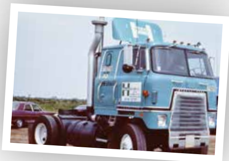
Haas truck, 1980.