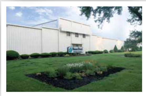
Wauseon, Ohio, offices, 1996-2014