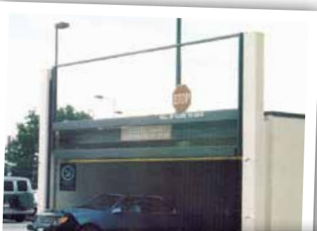
The HVG 420, the second gate operator invented by Harris, ca. 1979.