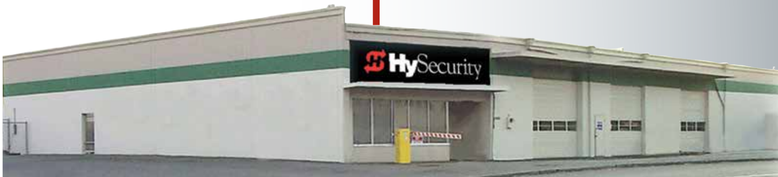
An early HySecurity location in Seattle, ca. 1990s.