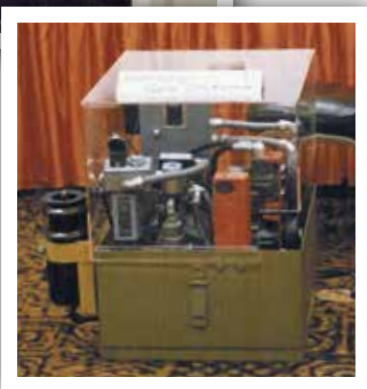
Early model of the HSG 120, ca. 1980.