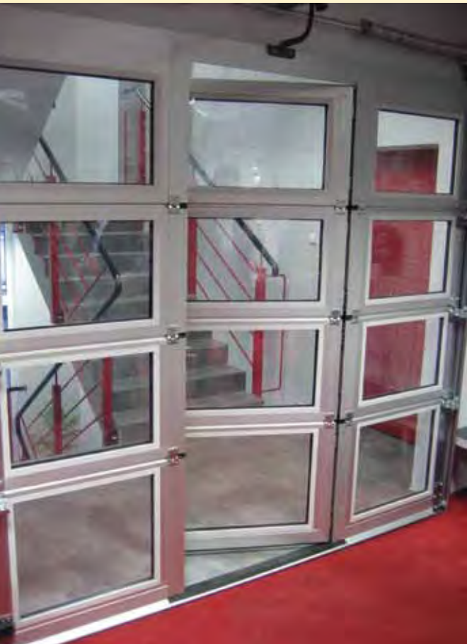
▲ Pass doors are common. New: 1" threshold.