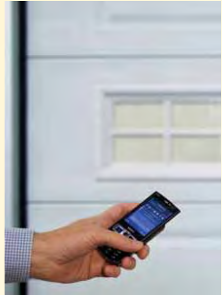
▲ Cell phones now open doors.

The garage door in Europe is continually evolving to meet a higher quality standard. This constant improvement is driven by the European Harmonized