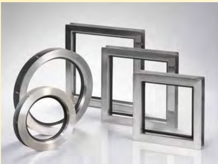
▲ Stainless steel-framed windows are hot products.