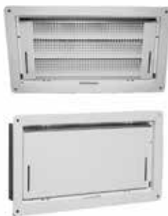
Insulated and Dual Function models available