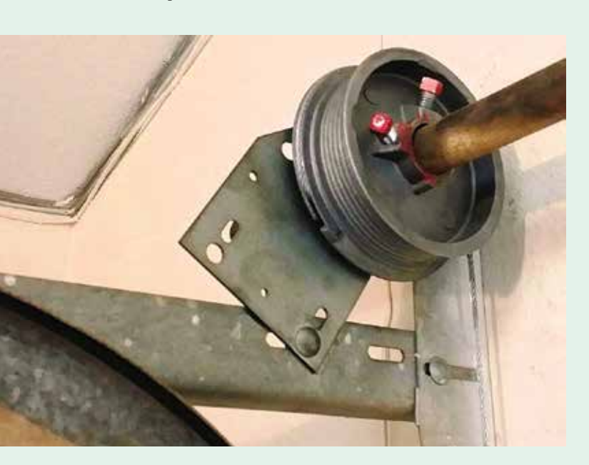
NEW END PLATE? The invoice clearly states that Swails' three garage doors received three pairs of end bearing plates (@ $155.99 each!). However, this plate is not new. This photo was taken on June 13 by Lance Little of Security Garage Door, only eight weeks after its alleged installation.

"I don't have a whole lot of comment for you guys right now," he told the reporter.