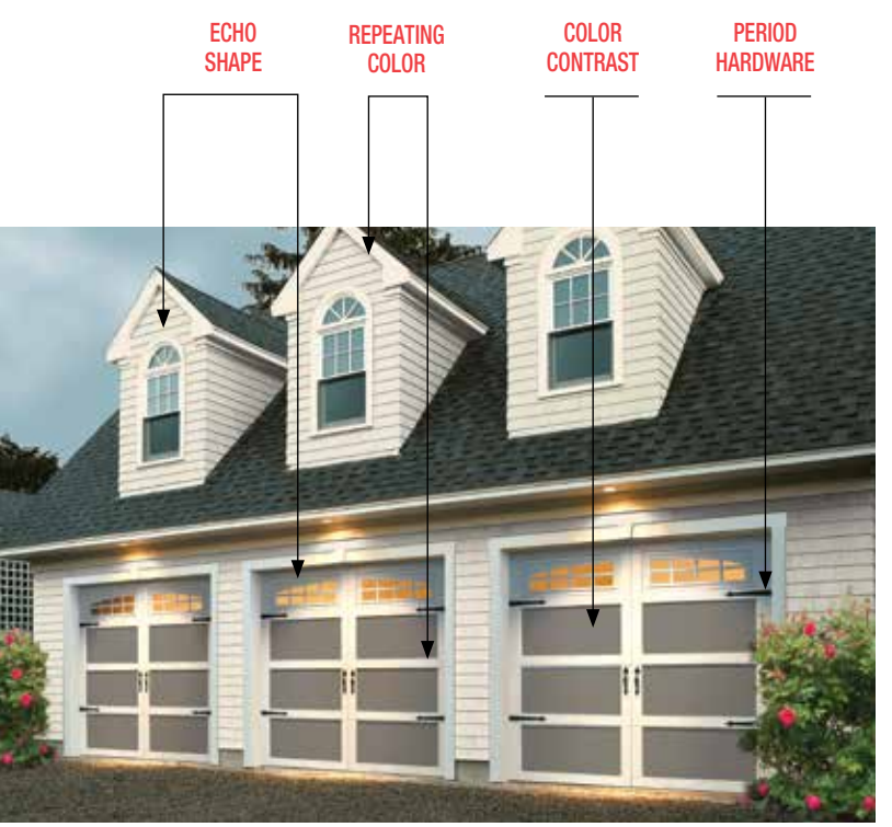
Overhead Door Courtyard Collection 161 steel door, courtesy of Overhead Door.