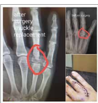
A GDT member posting about a serious hand injury caused by a winding bar.

Whether posting about a technical issue, showing off an impressive installation job, or uploading a picture of a bloody severed finger, members can immediately communicate to one another on a variety of topics and know the audience can relate.