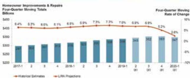
Leading Indicator of Remodeling Activity – First Quarter 2019

Annual gains in home improvement and repair spending are projected to continue decelerating through early next year, according to the Leading Indicator of Remodeling Activity (LIRA) released in April by the Remodeling Futures Program at the Joint Center for Housing Studies of Harvard University. The LIRA forecasts that year-over-year growth in homeowner remodeling expenditure will slow from about 7% today to 2.6% by the first quarter of 2020.