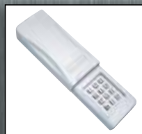
Wireless Keypad with Sliding Cover