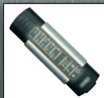
Telecody Wireless Keypad