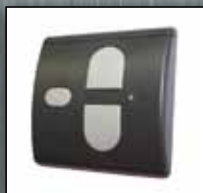
Wireless Wall Button