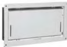
Insulated and Dual Function models available