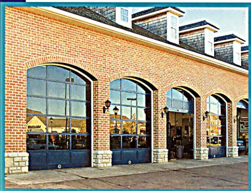
Commercial Garage Doors

DASMA is North America's leading trade association of manufacturers of garage doors, rolling doors, garage door operators, vehicular gate operators, and access control products. With association headquarters based in Cleveland, Ohio, our 90 member companies manufacture products sold in virtually every county in America, in every U.S. state, every Canadian province, and in more than 50 countries worldwide. DASMA members' products represent more than 95% of the U.S. market for our industry.