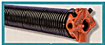
Garage Door Components