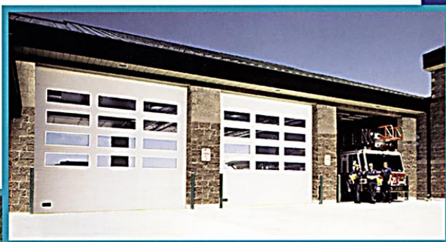
Industrial Garage Doors