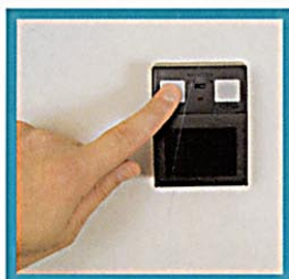
Garage Door Remote Controls and Electronics