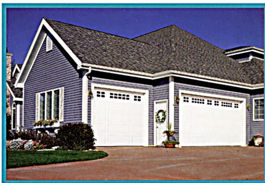
Residential Garage Doors

Through DASMA, the industry has increased its focus on safety issues such as proper installation procedures and better protection against high winds, fire, entrapment, and finger injuries. We seek to continually strengthen our role as the authoritative voice of the industry to consumers, the media, the construction industry, and government.