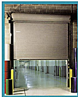
Rolling Steel Doors

The strategic planning and policy-making authority of the association rests with the DASMA board of directors. Officers of the association rotate among the active divisions to ensure that the association represents the entire industry.