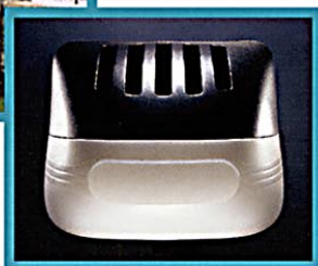
Residential Garage Door Operators