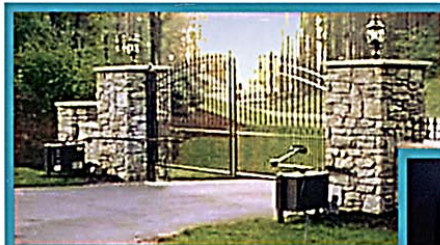
Automatic Gate Openers

DASMA's "active members" produce upward-acting residential and commercial garage doors (Commercial & Residential Garage Door Division), operating devices for garage doors and gates, sensing devices, remote controls for these operators (Operators & Electronics Division), as well as rolling doors, fire doors, grilles, counter shutters, sheet doors, and related products (Rolling Door Division).